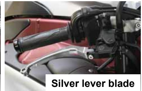
Silver lever blade