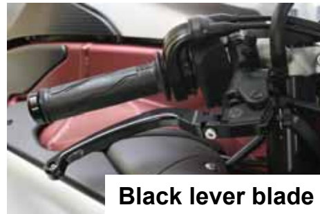
Black lever blade

*This is the race oriented lever. The application is limited. Please ask us for the application!